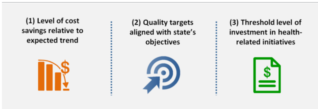
Figure 2. Rate-Adjustment Criteria

The third criterion, the threshold level of health-related investments, is aimed at ensuring that plans are not benefiting from the rate adjustment unless they are investing in health-related initiatives at a minimum level, which could be proportional to the number of lives and defined as a per member per month amount. Allowable initiatives